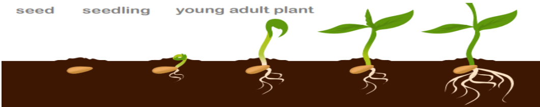
seed seedling young adult plant